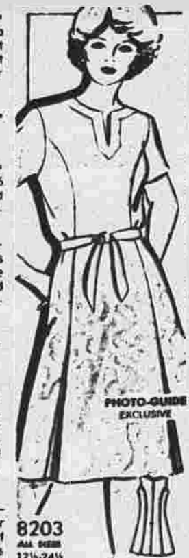
8203 See page 12 for more information.

63 MISCELLANEOUS FOR SALE: CAR RADIO - Excellent condition. Includes Dabby MR. Bass and Treble controls and more. 990. Call 646-1063 other 4:30pm.