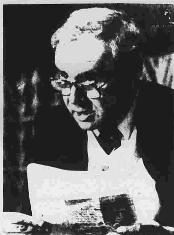
To stand trial

The crime advocates takeover of American society by a group of white males who begin the "revolution by first funding itself by robberies, counterfeiting and other crimes," the FBI complaint said.